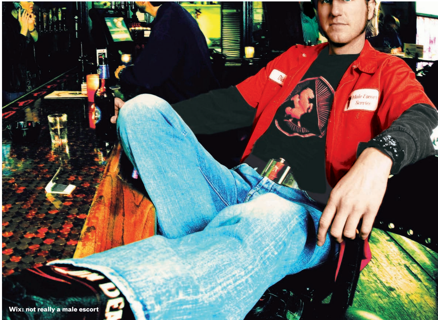
Wix: not really a male escort